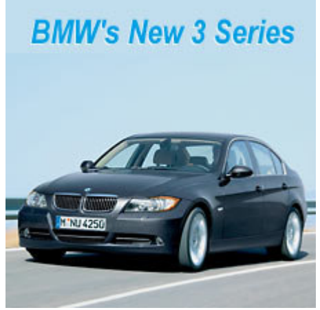
Click here for the slide show.

No estimated price is available for the new 3 Series, but the current sedan starts at $29,995 (including destination charge). With its performance due to increase thanks to new engines, the 3 Series' price could go up as well.